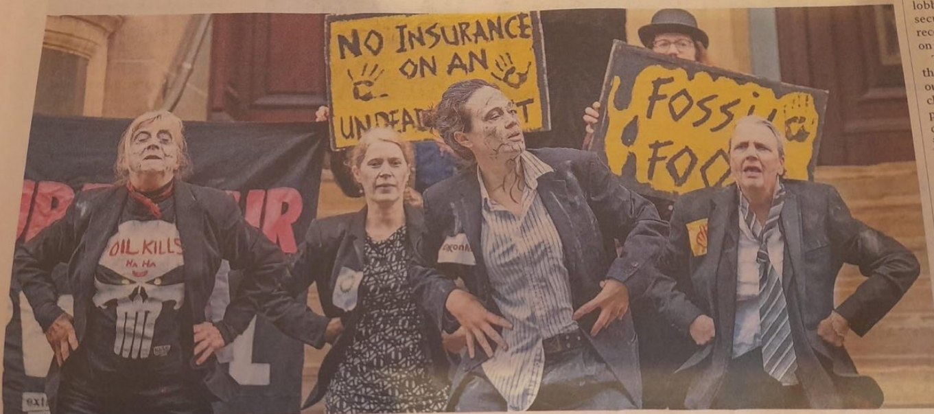
Climate change activists perform a Killer Drillers dance routine dressed as zombies outside offices of various insurance companies in Glasgow yesterday. Extinction Rebellion Scotland said: 'Without insurance, there are no new fossil fuel projects. It's time that these companies insure our survival'