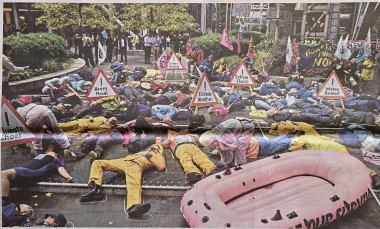
Die hard activists A group of Extinction Rebellion members stage a "die-in" – a form of protest during which participants pretend to be dead in a public space – outside the Lloyd's of London headquarters as they begin three days of demonstrations calling on insurance companies to stop insuring fossil fuel projects.