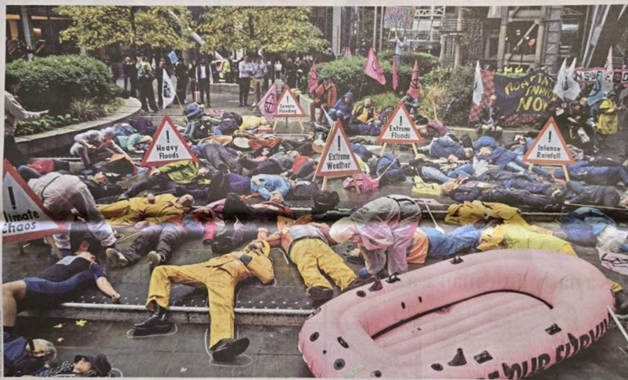
Die hard activists A group of Extinction Rebellion members stage a "die-in" – a form of protest during which participants pretend to be dead in a public space – outside the Lloyd's of London headquarters as they begin three days of demonstrations calling on insurance companies to stop insuring fossil fuel projects.