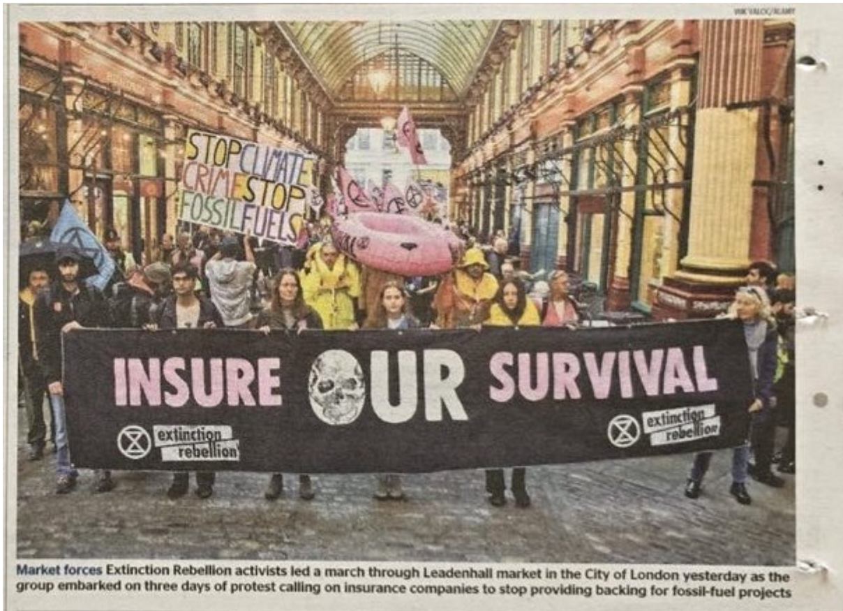
Market forces Extinction Rebellion activists led a march through Leadenhall market in the City of London yesterday as the group embarked on three days of protest calling on insurance companies to stop providing backing for fossil-fuel projects