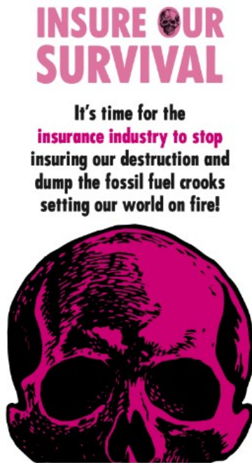
PUBLIC - GENERAL