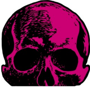
PUBLIC - GENERAL

It's time for the insurance industry to stop insuring our destruction and dump the fossil fuel crooks setting our world on fire!