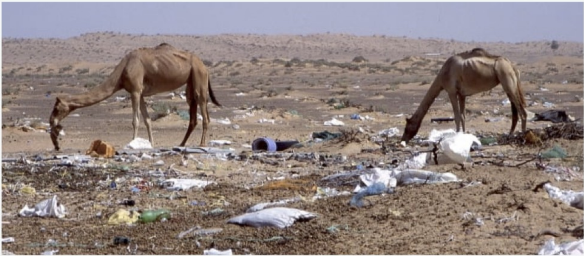
Camels feast on garbage in the desert outside Dubai.